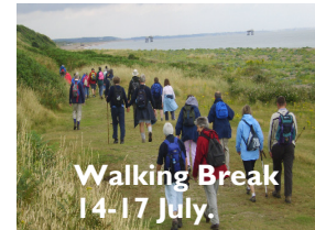
Walking Break 14-17 July.