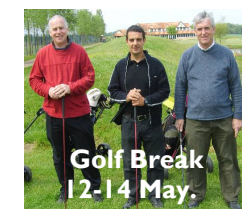
Golf Break 12-14 May.

We are again offering two Mid week Breaks this year. Visit www.sizewellhall.com or ring 01728 830715 for details.